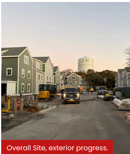
Overall Site, exterior progress.